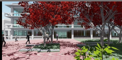
Accessibility Slopes, an elevator, air-conditioning units, and restrooms that can be used by students with disabilities and of all genders will be installed.