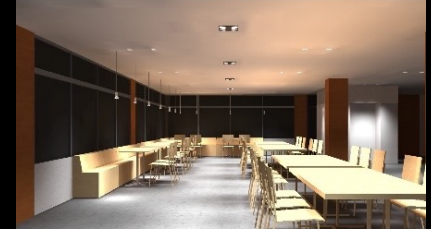
International – a space where all students can feel at home