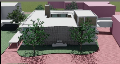
Diffendorfer Monument The monument facing the honkan will be lit up