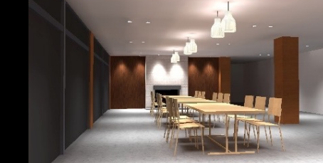
Christianity – a space that reimagines architect Vories' living room